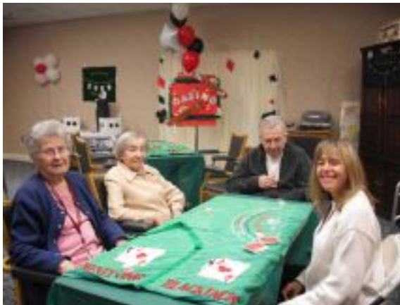
OK ... the dealer’s break is over ... now let’s get off to the races!