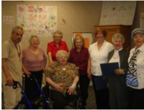
Respite Program Participants

The Caregiver Respite Program allows participants to stay at a licensed adult home or senior residence for one week, allowing respite for their caregiver. The County's highly successful, free program is meant to serve as a break in the daily routine for both the participant and their caregiver. Participants must be residents of Rockland County and at least 60 or older to qualify for the respite program.