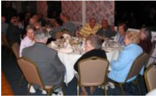
Our residents said the luncheon was delicieux .