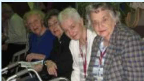
Our residents watch in anticipation of our newly renovated dining room!

Fox Rehabilitation Mission: To believe in our therapists—to give them the autonomy to give the finest quality rehabilitation to the geriatric population with compassion and respect. To believe in our patients and their ability to achieve what they once thought impossible—optimal function to rehabilitate their lives.