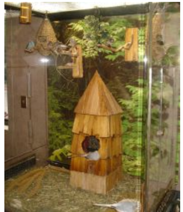
The Aviary at the Esplanade at Chestnut Ridge

So if you need to relax and unwind a little bit, make sure to spend a few minutes visiting our aviary next time you're at The Esplanade. It's sure to bring a smile to your face!